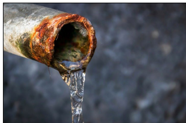
Corroded Lead Pipe.

Within Table 1, 2, and 3 you may find terms and abbreviations that are familiar to you. To help you better understand these terms, NSFDL has provided a definitions chart.