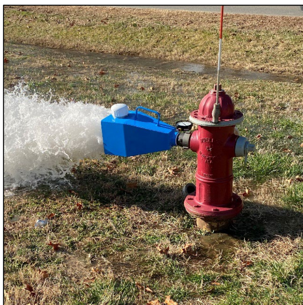
Fire Hydrant Flushing at Naval Support Facility Dahlgren.

https://www.epa.gov/dwreginfo/lead-drinking-water-schools-and-child-care-facilities .